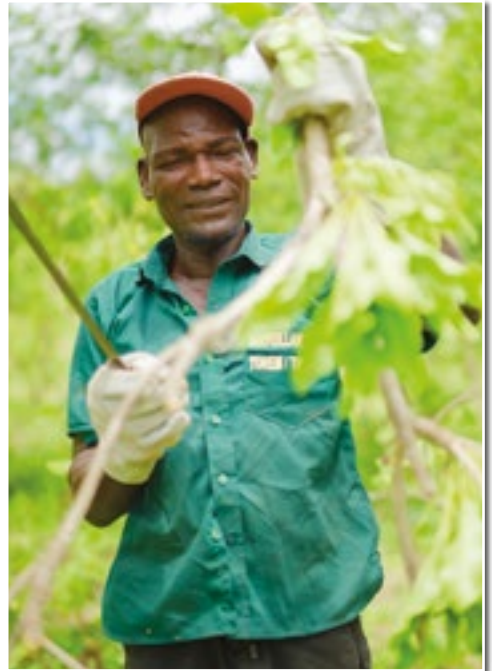
This is an excerpt from a blog published on the TREE AID website.

By improving the way forest resources are being managed in West Africa, the project has not only protected against forest degradation and deforestation but also ensured the restoration and regeneration of over 22,000 hectares of degraded forest.